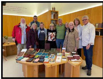
The team in Slovenia purchased more Bibles than the company had ever sold at one time!

On a recent trip to Slovenia, I was reminded of the simplicity of planting Gospel seeds. Our team was granted the opportunity to help lead a children's club event one evening. The trip was positioned around the celebration of Reformation Day, October 31, which is a national holiday in Slovenia. They celebrate the