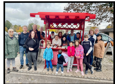
The Slovenian mission team shared the Gospel in the marketplace.

Each year we share dates for trips. These trips are opportunities for you to journey with us for a week or so in another context. While walking alongside other believers, we have the opportunity to spread Gospel seeds, nurture young believers, encourage those working daily in these fields and sometimes celebrate the harvest when souls are saved. These short term missional experiences help us step out of our normal routine and home context for a week of focused work and training. We work with churches in these