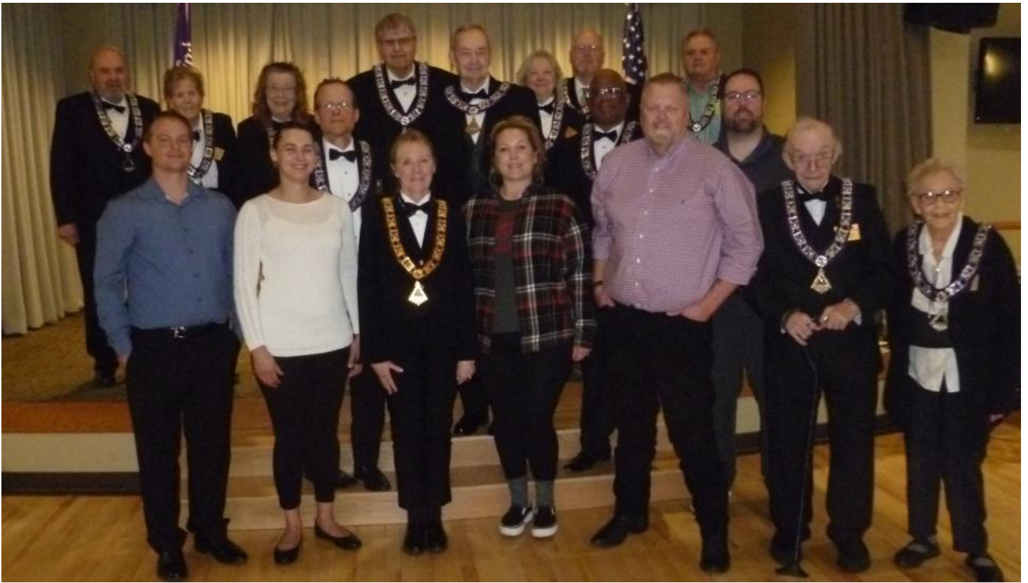
January's Initiation Class