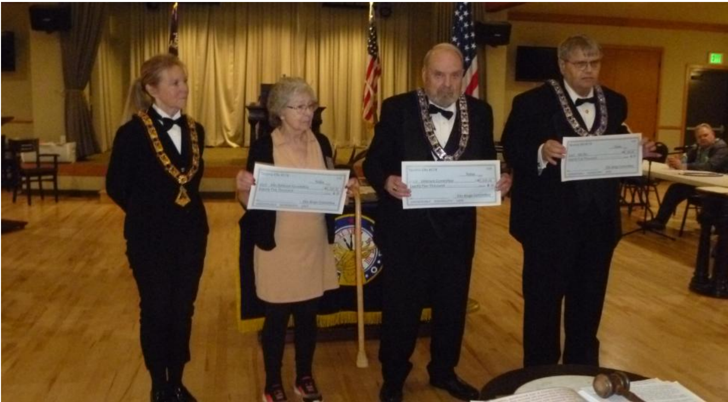
Bingo Supports Lodge Charities