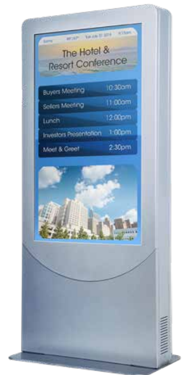
KIPC2555 shown in silver

Comes fully integrated with 55" display, 10-point IR touch overlay, & a BrightSign® XT1144 Expanded I/O Player