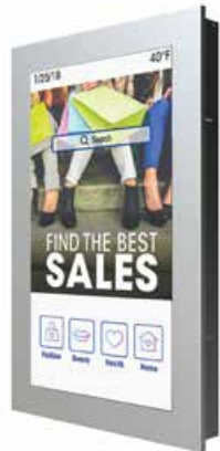
KIP746-S shown in silver