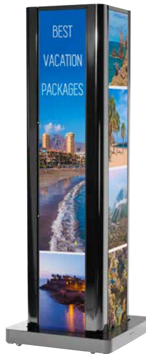
KIP586-4LG shown in black