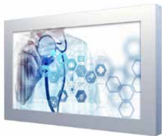
KIL655 shown with custom color