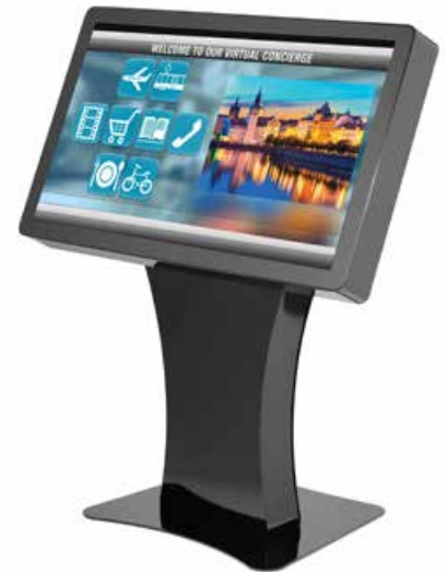
KILH542 shown in black

For the LG 86BH5C Ultra Stretch Signage Display(s)