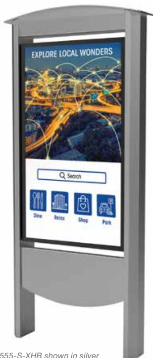
KOP2555-S-XHB shown in silver

Choose from a versatile array of sleek, slim and attractive standard kiosk enclosures or create a completely unique kiosk solution fit for any application and market - corporate, education, quick serve restaurants, hospitality, stadiums, retail and more. Our kiosks are customizable in every way - from the choice of technology to custom paint and vinyl wraps. If you can envision it, then we can make it happen.