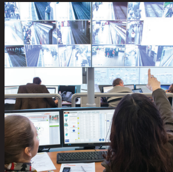
Video Switching and Extension