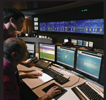
Real-Time Data Visualization