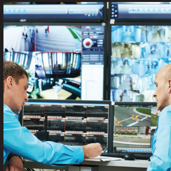
Collaboration and Control