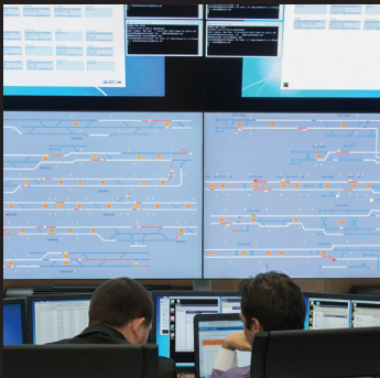
KVM Switching and Extension