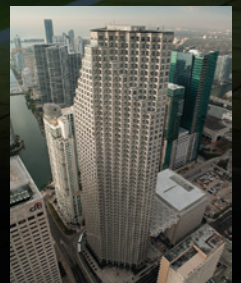
Southeast Financial Center Miami, FL