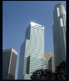
Citigroup Center Los Angeles, CA

Strengthen Your Leadership in Sustainability