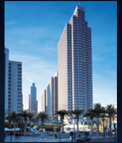
Embarcadero Center San Francisco, CA