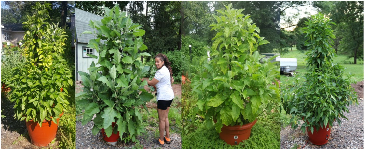
100 Organic Green Bell peppers