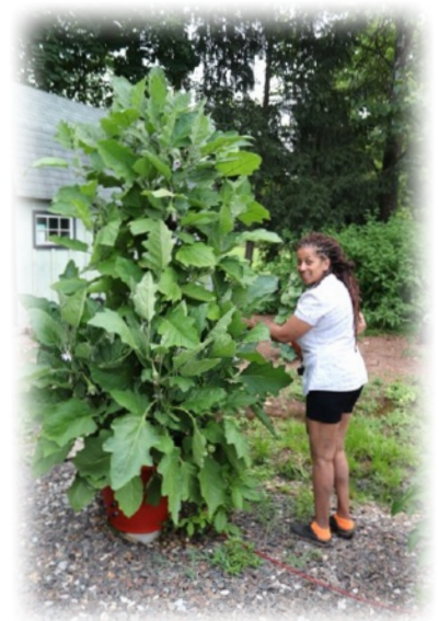
20- 30 Eggplants