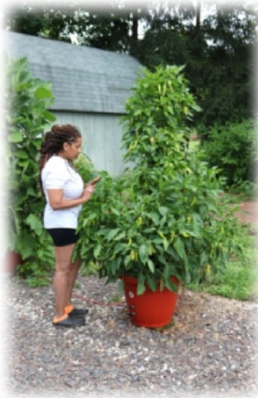
100 to 1,000 green peppers