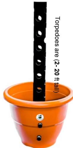
Base Pot (16-inches to 20 ft diameter)