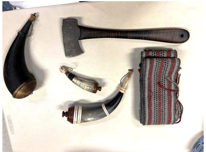
These fine items were made and donated to help raise money for Toys for Tots.