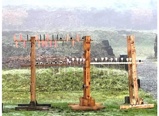
Those tongue depressors, dixie cups, lollipops and candy canes sure look small out at 25 yards.

The shoot itself was put on by Bill Sick and consisted of two paper bullseye targets with five shots on each, then a variety of novelty targets for the remaining ten shots. These included tongue