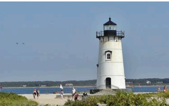
Lighthouse overlooking Vineyard Sound