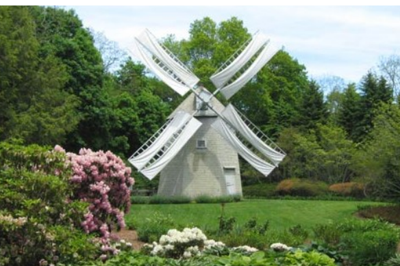
One of Cape Cod's many Windmills