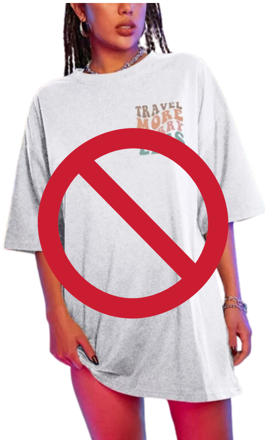
No Oversized Tshirts