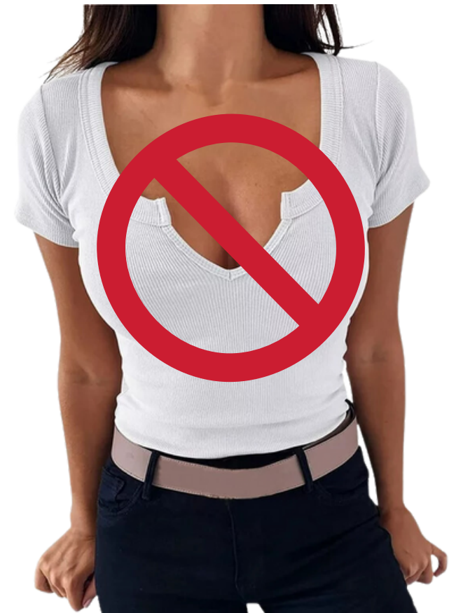
No Low Cuts