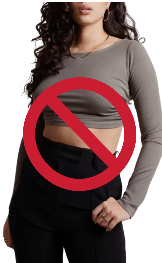
No Bare Mid-drifts