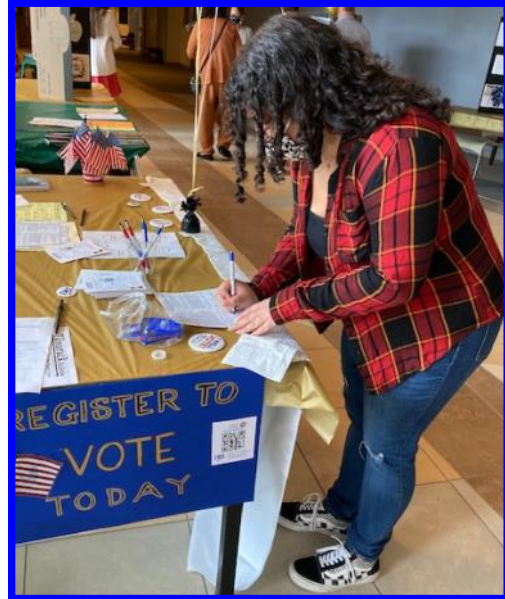
Naugatuck Valley Community College Voter Registration