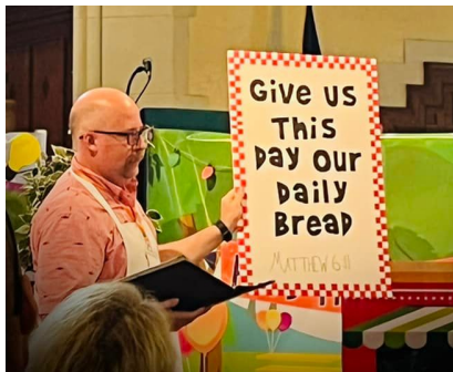
Last month's VBS "Food Truck Party " at BFUMC spiritual focused was on the Lord's Prayer.

Thank you to all those who helped make it a special week!