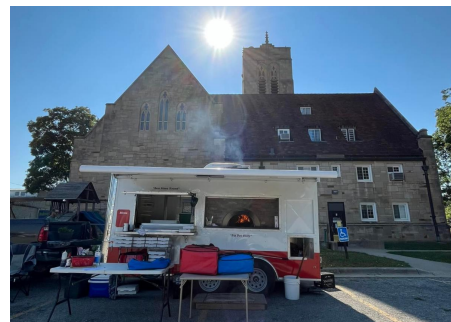
Local Food Pop Up truck came to help us celebrate at VBS.