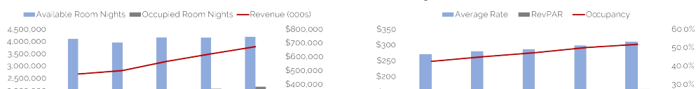
Hotel Revenues Grew more than 8%, RevPAR Nearly 7.5% in 2015/16 Ski Season

The following table summarizes supply, demand, and revenue in 20 ski resort markets in North America, spanning more than 11,000 daily room nights.