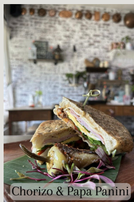
Chorizo & Papa Panini

any style, topped with Cilantro, Queso Fresco & Sour Cream