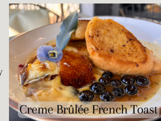
Creme Brûlée French Toast

To preserve our flavor experience, Substitutions & Special Preparations are available only for some menu items.