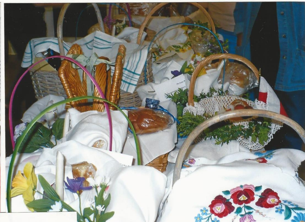
EASTERN EUROPEAN TRADITION OF BLESSING OF THE EASTER FOOD BASKETS