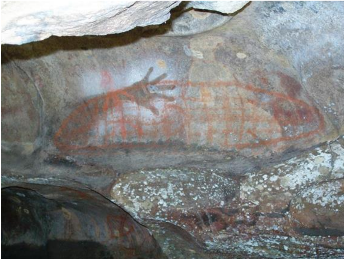
Image of a dubal bundle holding the bones of the dead. The left hand and arm silhouette signifies a person's acceptance.

Just around the corner from the birthing cave is a place where the bones of those who had died are wrapped in bark, called dubal , and placed in shallow caves in a rock face. The Nugal custom is to bury the dead to return the flesh to the earth. Later, the bones are collected, washed, embalmed with ochre, and put in a dubal bundle. They then put the dubal bundle in a cave near the person's place of birth. Willie said this completes the cycle of birth to death.