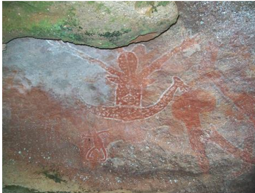
Birthing Cave new mother and baby with umbilical still attached