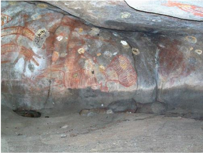
The reclined figure of a respected elder or teacher whose specialty is denoted by stripes high up his chest.