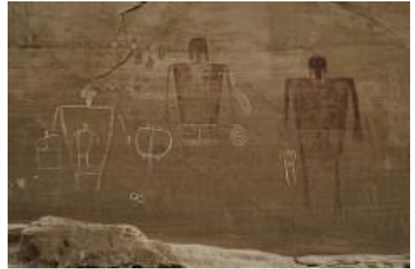
Rock art at Cedar Mesa Grand Gulch k in Bears Ears National Monument

Information is accurate at the time of preparation but check the listed web sites for specific details and any changes. Check the listed web sites for any fees, membership, and advance registration requirements