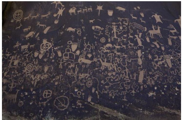
Rock art at Indian Creek in Bears Ears National Monument