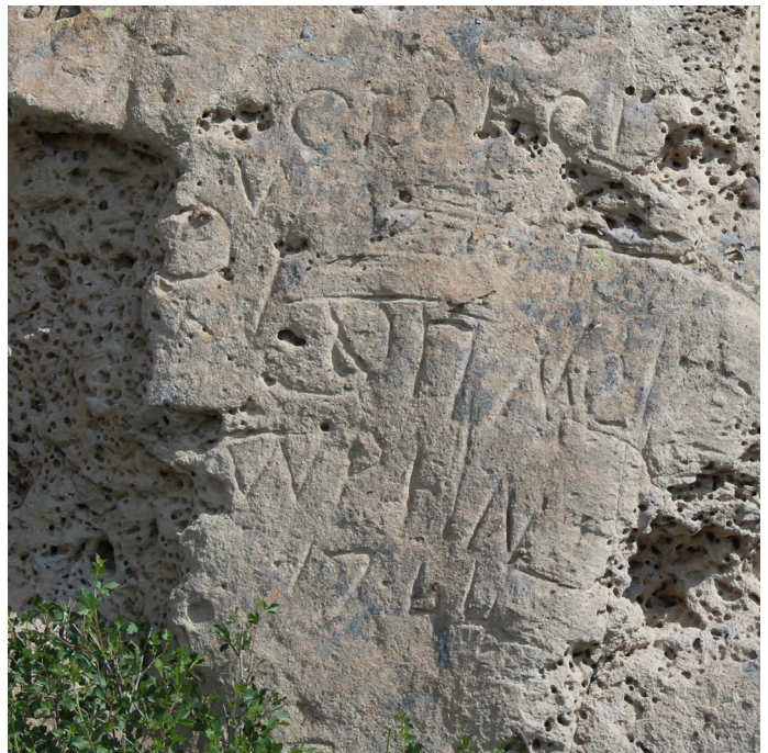
Historic graffiti.

An article addressing the BLM's role today in the protecting of cultural treasures including our rock art will appear in a future issue the "Pictures of the Past", the CRAA Newsletter.