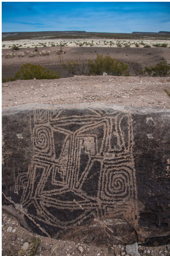
Apache Flats.

On March 28, the group caravanned from Las Cruces, NM, to Ft. Hancock, TX, about 54 miles south of El Paso. 24 miles of remote dirt roads brought us to Alamo Canyon.