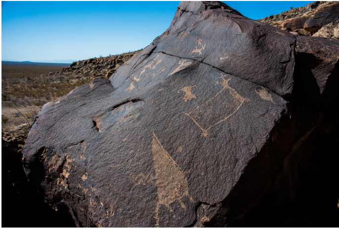
Alamo Canyon.

Researchers studying these images note that they contain particular styles and symbols prevalent in other areas of the Southwest, pointing to relations and interaction between various contacting cultures.