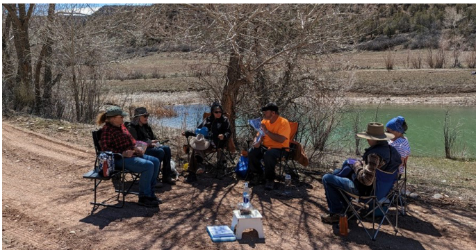
Photo: Lunch break with the team.