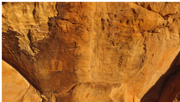
Photo: Petroglyphs at B&B Ranch