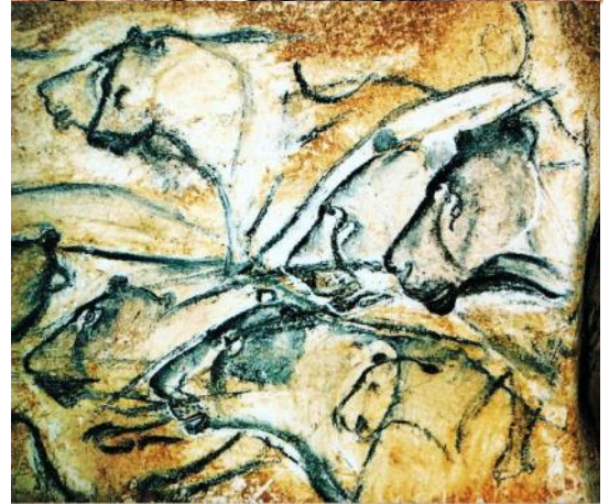
Top: Chauvet Cave, France. Internet photo - Public domain. Middle: Close-up of upper Rhinos. Chauvet Cave, France. Internet photo - Public domain. Bottom: Chauvet Cave, France. Internet photo - Public domain.