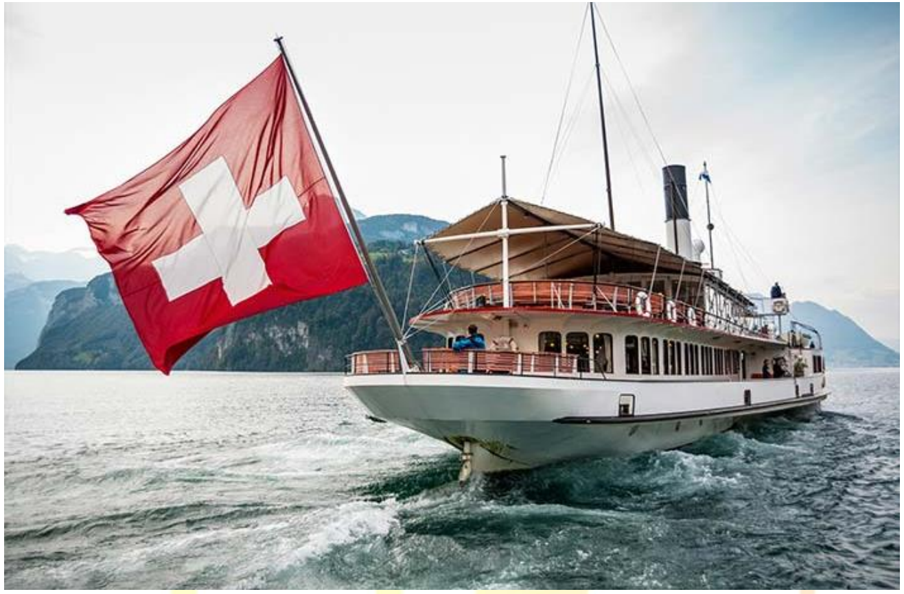
After a day in the surrounding Alps, head off for a cruise on the Lake.

Return back to your hotel after your visit to Lucerne. Overnight at the hotel.