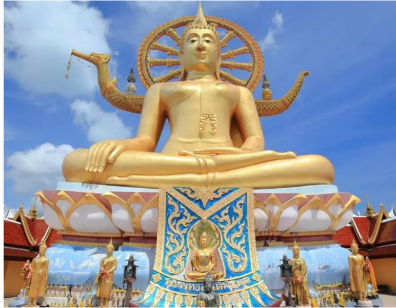
Golden Buddha of Koh Samui

Cool off at Na Muang waterfall, one of Koh Samui's most scenic waterfalls.