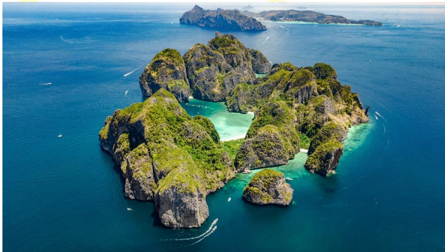
Maya Bay - Shooting location of the movie 'The Beach' starring Leonardo Di Caprio

Arrive in Maya Bay for sightseeing and take photos, sightseeing in Loh Samah Bay and Pileh Cove, visit Viking Cave.