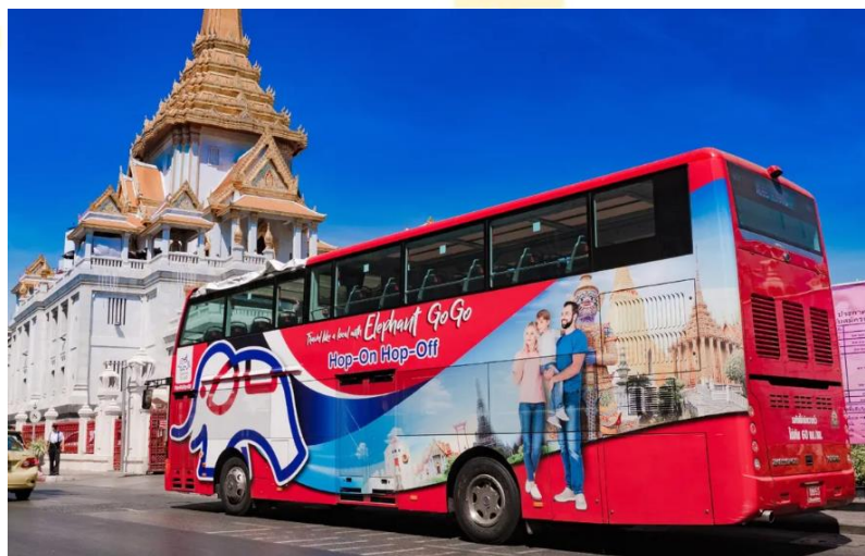
Bangkok Hop-on Hop-off Tourist Bus for 24 hours

Breakfast at the hotel. Proceed on your own towards the Hop-on hop-off bus stop which is few minutes' walk from your hotel. Explore the iconic sights and attractions of Thailand's capital with a fun hop-on hop-off adventure around Bangkok. Easily get on and off at any of the tours' stops, a perfect idea if you prefer to explore the attractions a little longer. Make a stop at locations like Siam Square, Wat Pho, Golden Buddha Temple, Khao San Road and more. Enjoy the stories about the rich history and culture of Bangkok while you travel from the onboard audio guide.