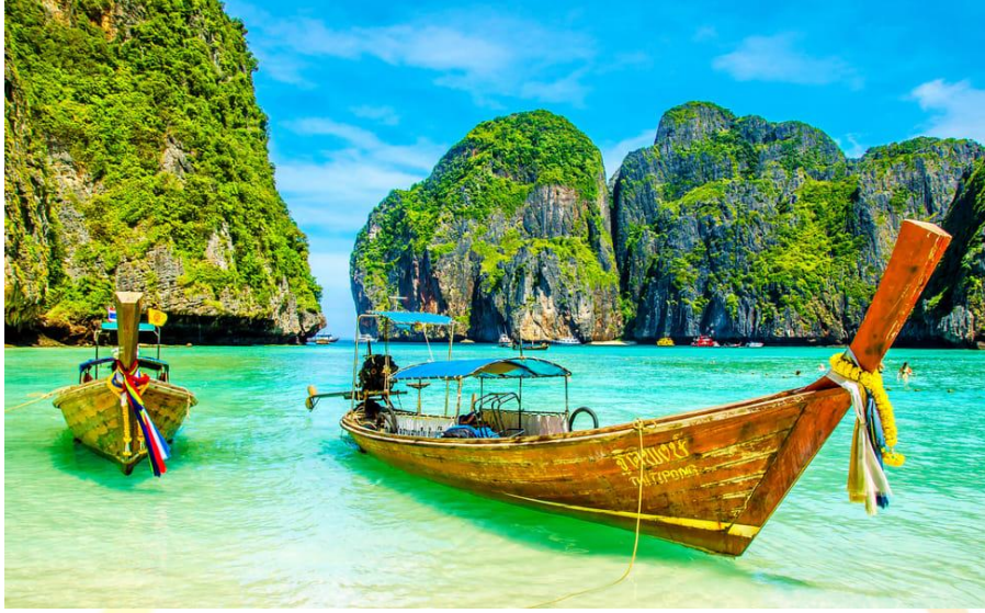
Phi Phi Islands

Arrive in Maya Bay for sightseeing and take photos, sightseeing in Loh Samah Bay and Pileh Cove, visit Viking Cave.