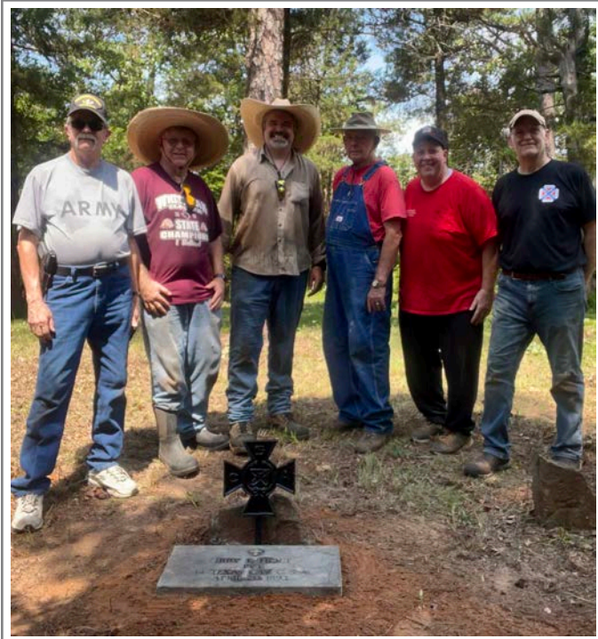
The dirty and sweaty clean up crew!

June 10, 2023 members of the Walker's Greyhounds gathered at the Holt Cemetery to clean the old burial grounds in preparation for an iron cross dedication held on June 11, 2023.