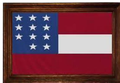
11th Texas Infantry