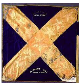
14th Texas Infantry