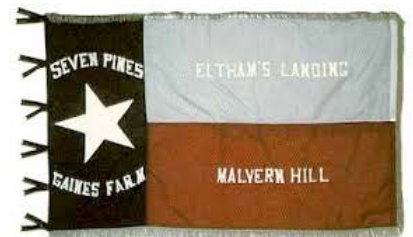
1st Texas Infantry