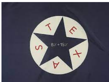
15th Texas Infantry