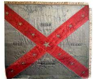
3rd Texas Infantry