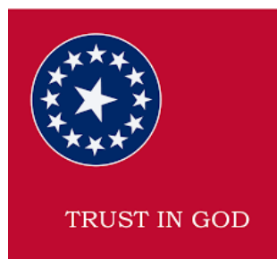
17th Texas Infantry.