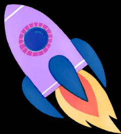
PHOTO CONTEST RULES

We are ready to celebrate Month of the Military Child in a big way! ARNG Child and Youth Services wants to see photos of how your child is "Out of This World" being a military kid or ways they are giving back and making our world better. This national photo contest is open to National Guard youth ages newborn to high school seniors. One photo submission per child per week. Any type of camera may be used. We encourage you to write a brief statement as to why your photo represents the theme.