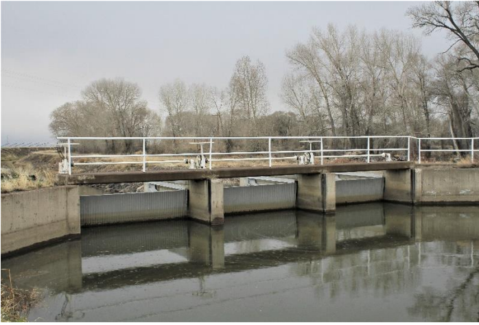
Headgate looking downstream