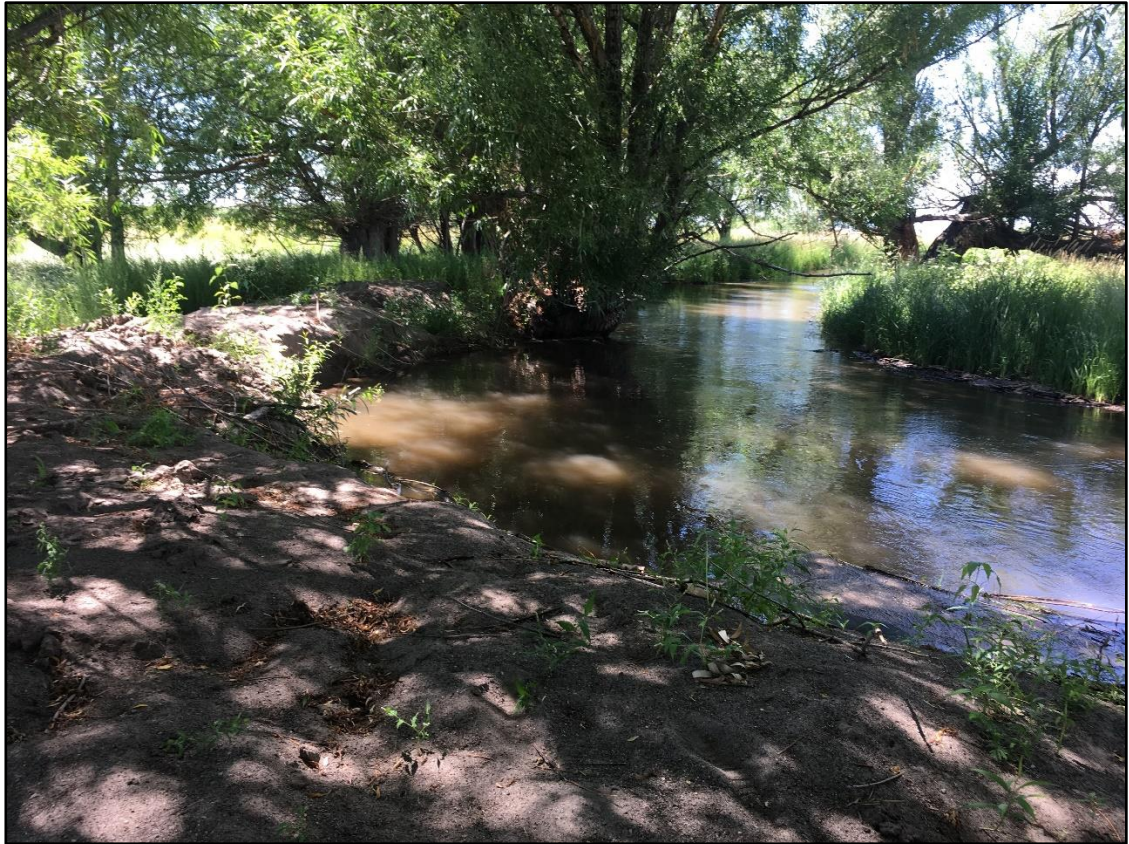
Failed bank that was reinforced with compacted soil