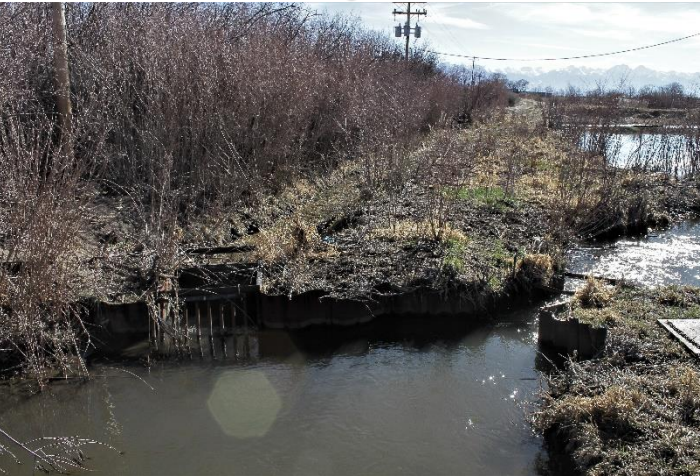
Flume looking downstream