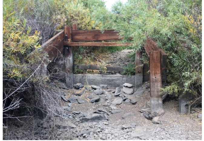
Diversion dam looking upstream