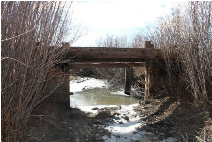
Diversion dam looking downstream