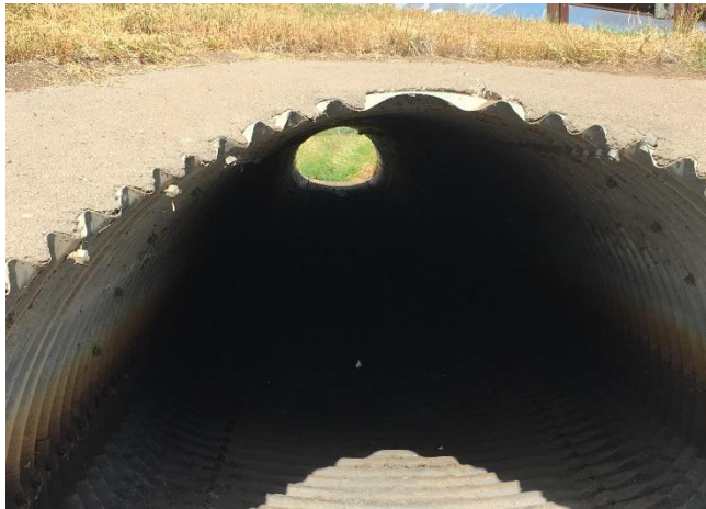
Culvert under Hwy 285 looking upstream