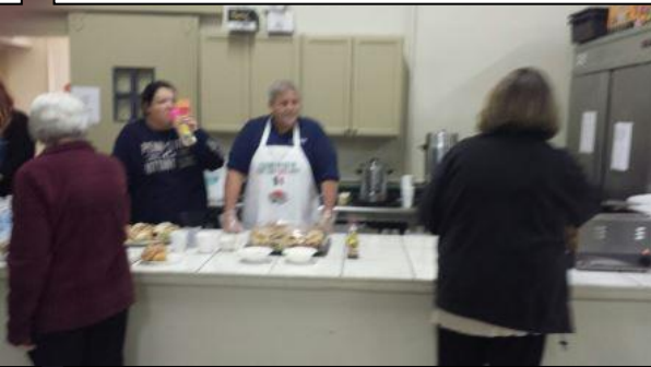
Hot and cold lunches were served to all