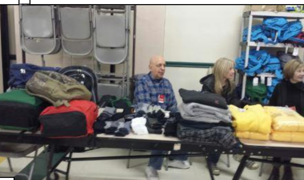
(left) Operation Chill Out from Long Valley gave out backpacks filled with thermal underwear, hoodies and warm pants, hats, gloves and socks