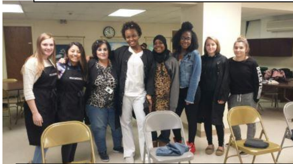
Students of Cosmetology gave free haircuts