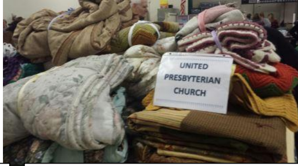
Quilts made from pieces of old blankets