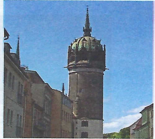
Castle Church in Wittenberg, Germany, where Martin Luther posted the Ninety-five Theses in 1517.

In Lutheran Quarterly's "Timeline of Global Lutheranism," 10 topics for each of the five centuries since Martin Luther's posting of the 95 theses help tell the story of the Lutheran church. Different subjects highlight Lutheran experiences in various times and places. The list invites readers to consider what they think is missing and what they would suggest adding – making the timeline an open conversation.