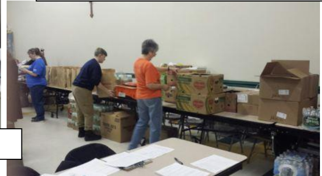
NORWESCAP filling bags to distribute food