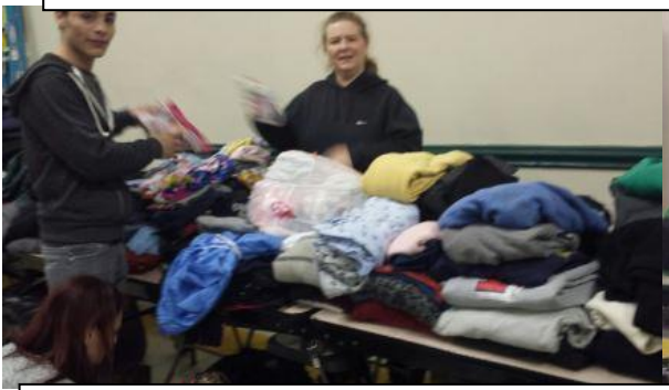
Catholic Charities had piles of warm clothing