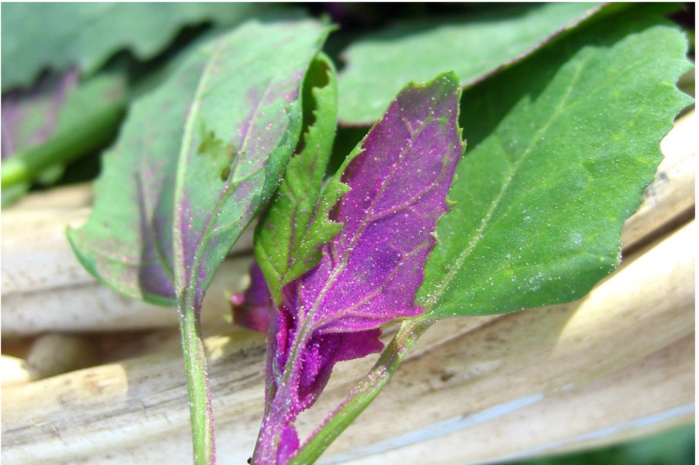
Edible wild greens (lambsquarters) (CUESA)