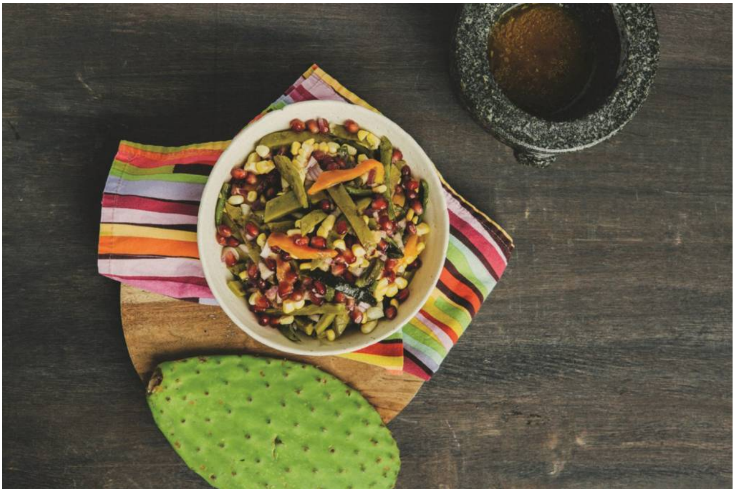
A dish made with nopales