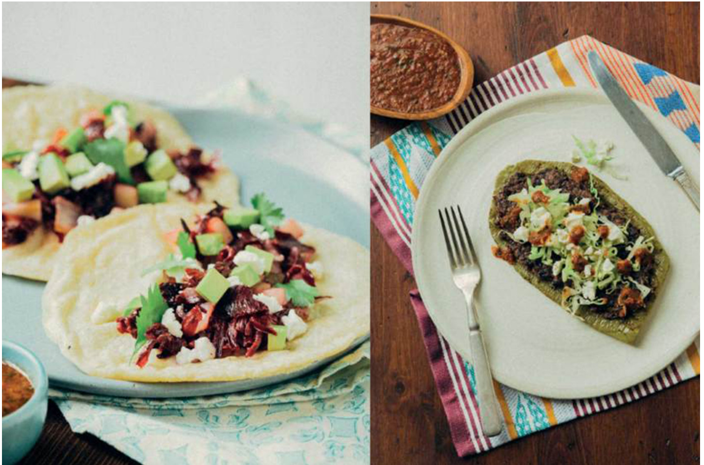
When the Spaniards came, they introduced meat such as pork and beef, as well as sugar.

When I think about decolonizing our diet, it's not just about health because our bodies are connected to the air, the water, and the food supply. We have to be thinking about bigger issues and focus on decolonization as a framework. Moreover, we have to acknowledge that farmworkers are also being exploited in the fields so that we can eat fresh vegetables, and the water is being polluted while indigenous peoples have been denied access to their land for ceremonies and growing their food.