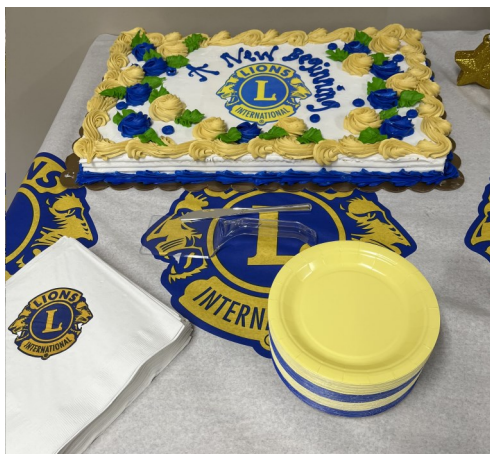
The Cake was almost too pretty to cut... The dignitaries and the Webb Park Apts residents enjoyed the refreshments provided by the Biloxi Lions and the McComb Lions Clubs