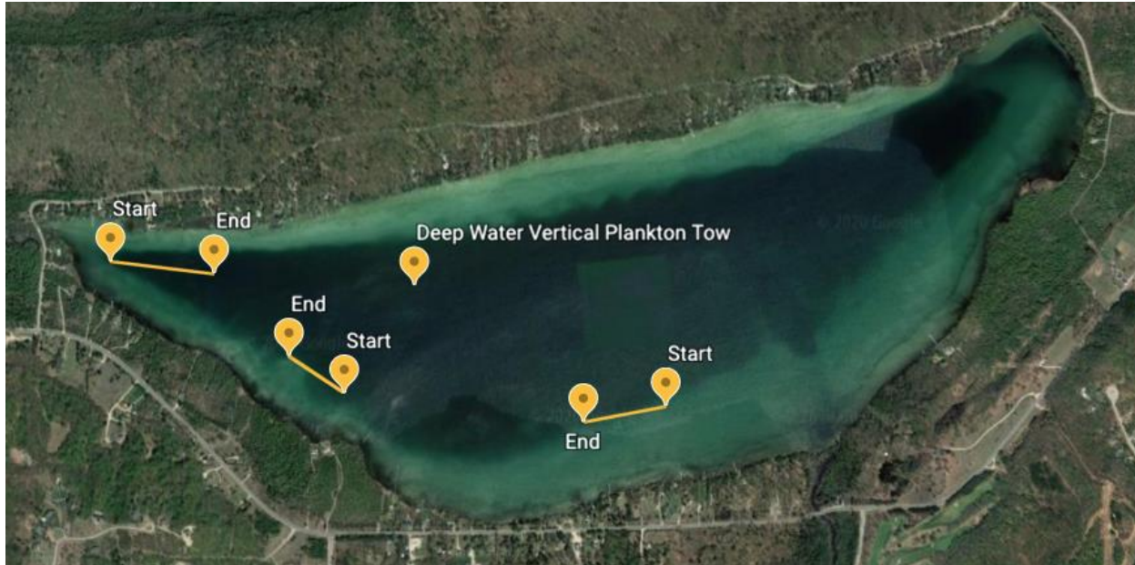
Diagram 2: 2020/2021 Plankton Tow Locations