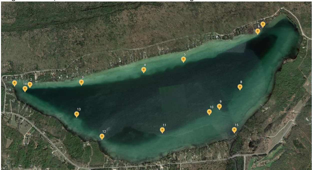
Diagram 1: 2020/2021 Rake Toss Collection Locations Google Earth