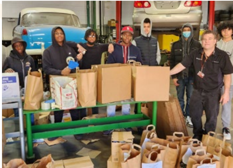
MVHS Students Organize Districtwide Collections for MVFT Feeding Westchester Food Drive