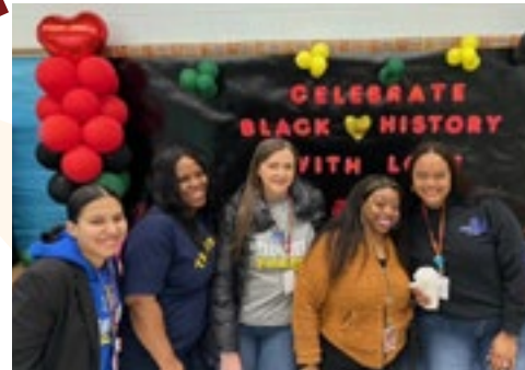
Traphagen Black History Celebration

Spirit Week brings fun and laughter to our work environment. Stick Together and Stay Positive!