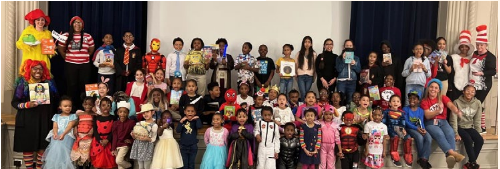
Williams Read Across America Celebration with students