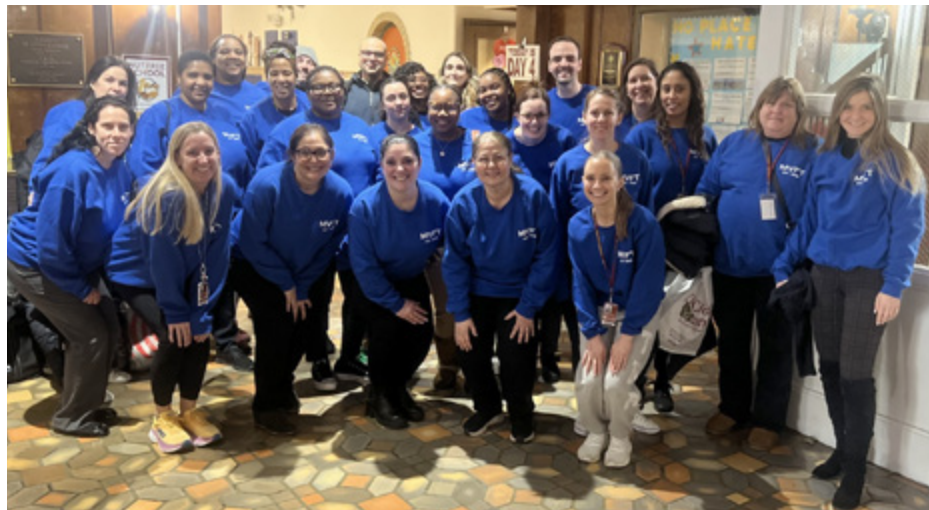
Pennington Staff Shows Strength in Unity #mvftstrong