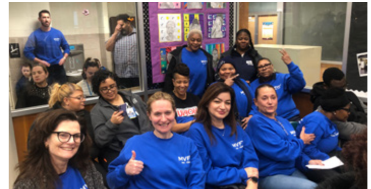
MVFT Coming Out in Force for BOE Meetings

Board Meeting dates for the remainder of the 2023-2024 school year: