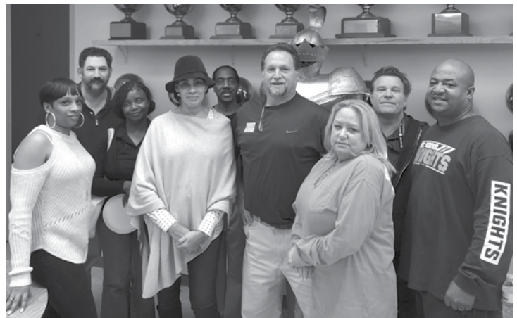
SRP Day at MVHS

The office will be closed between July 29th and August 2nd and will reopen on Monday, August 5th.