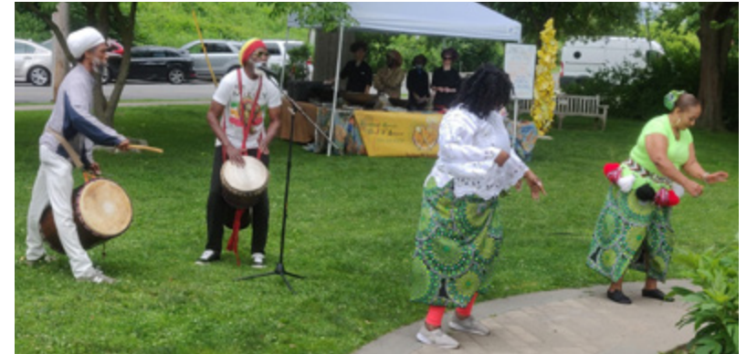
The Afrikan Healing Circle drummers and dancers

DSWA drumline, The Mount Vernon Afrikan Healing Circle drummers and dancers, and students from the art department of Pelham High School collaborated in the first Juneteenth Celebration in Pelham, NY. This collaboration was the first of many projects to bring awareness and understanding between diverse communities.