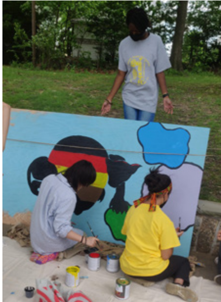
Art collaboration with Pelham HS