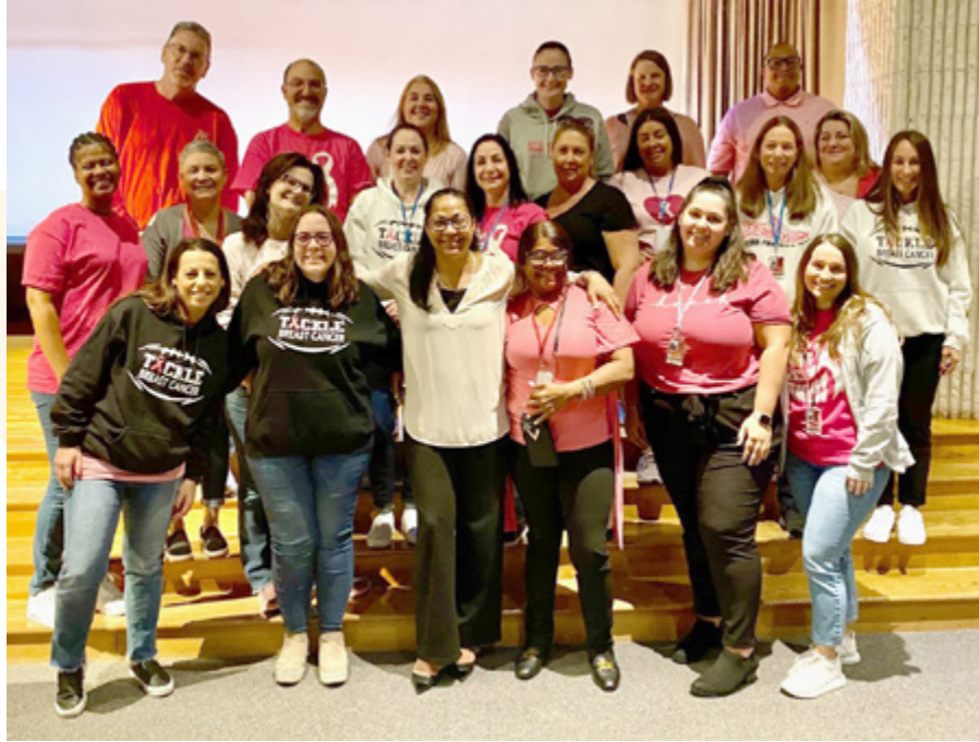
Lincoln togetherness in Making Strides Against Breast Cancer and wearing pink!

The Mount Vernon teachers would like to express their sincerest gratitude for all the teaching assistants and security guards in the district that come to work every day working with our students with enthusiasm, pride and keeping our students safe. The positive attitude that you bring daily into our classes and in the hallway motivates the students to learn and grow. We are thankful to the teaching assistants that are always willing to be a team player and support all the scholars in the schools. We appreciate the teaching assistants that work collaboratively with the classroom teachers. Thank you for always being a lifelong learner, willing to learn and try all the new strategies presented in class and on professional development days. Thank you for all you do. Keep up the amazing work.