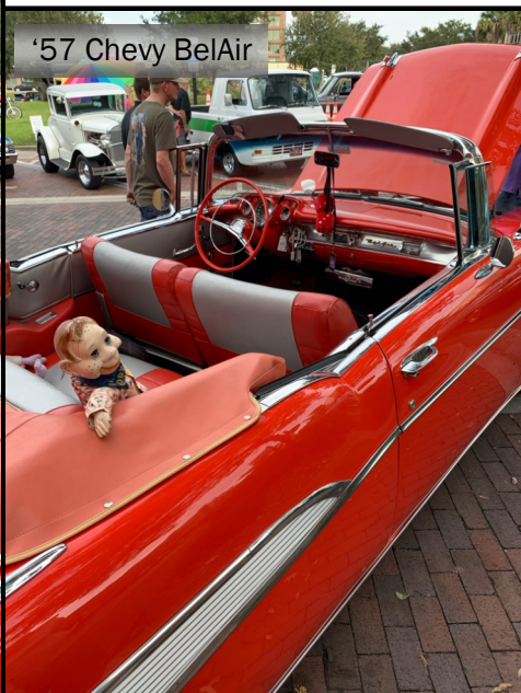
'57 Chevy BelAir