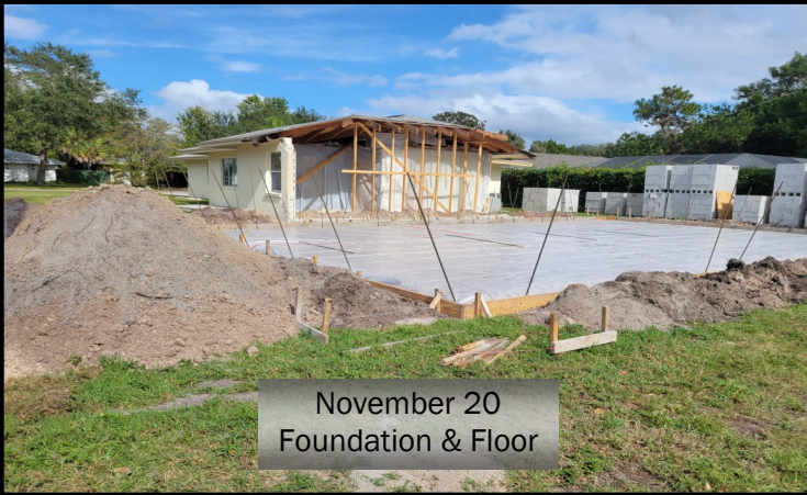
November 20 Foundation & Floor