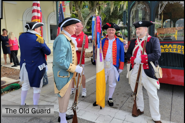
The Old Guard