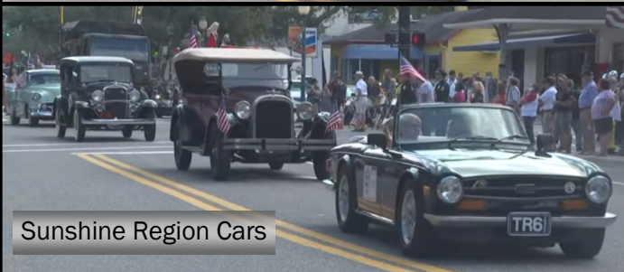
Sunshine Region Cars