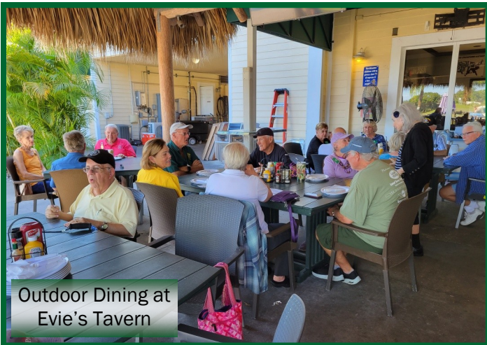
Outdoor Dining at Evie's Tavern