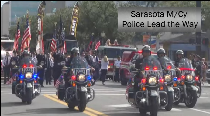
Sarasota M/Cyl Police Lead the Way