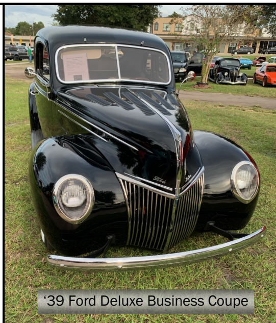
'39 Ford Deluxe Business Coupe