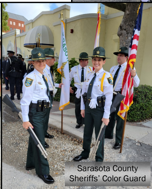
Sarasota County Sheriffs' Color Guard