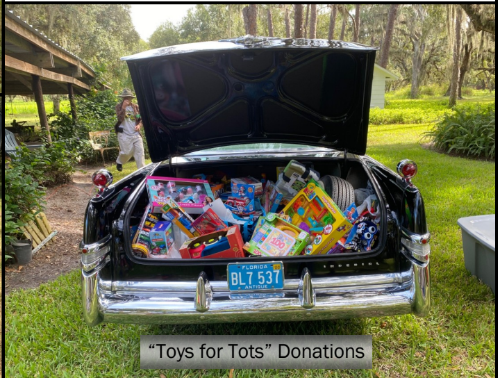
"Toys for Tots" Donations

Editor's Note: Club Members brought new unwrapped gifts to the meeting for donation to the "Marine Toys for Tots Foundation".