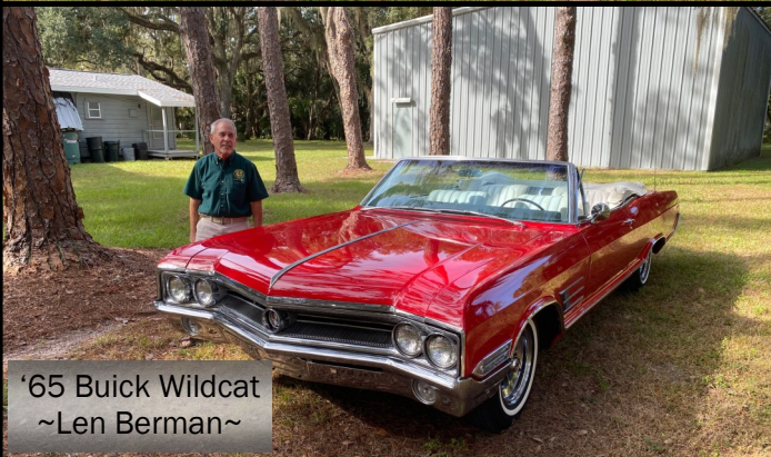
'65 Buick Wildcat ~Len Berman~