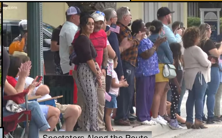
Spectators Along the Route