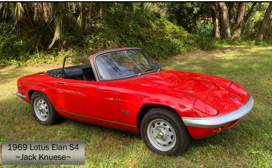
1969 Lotus Elan S4 ~Jack Knuese~