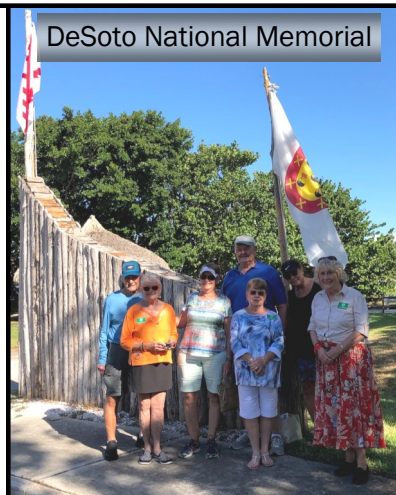
DeSoto National Memorial

It was a glorious, glorious day! Tuesday, October 26, the weather was delightful! A little cooler, a bit less humid, and a pleasant breeze caused the tour participants to experience a wee bit of "Paradise!" The group met at the Sarasota Classic Car Museum and a route to the DeSoto National Memorial found us viewing a very explicit movie about Hernando DeSoto's ill-fated search in America for gold & riches. The view of the Braden River from the bluff was spectacular, as was a trek though the native foliage. Leaving the Memorial Park, we proceeded to the Robinson Preserve, where two participants accepted the challenge and climbed the many steps to the top of the tower with an overlook of another magnificent scenic display, including a striking water view. Most of the group had lunch at the Old Salty Dog restaurant on Ken Thompson Pkwy! Food was great, service excellent, and fellowship much fun! Mote Marine was the final option for anyone who wanted to