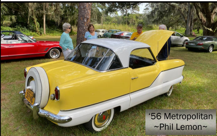
'56 Metropolitan ~Phil Lemon~