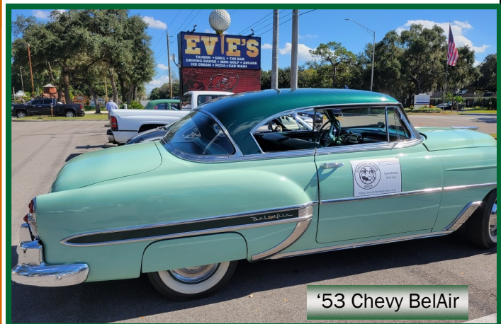
'53 Chevy BelAir