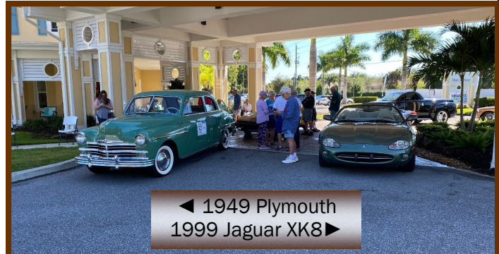
◀ 1949 Plymouth 1999 Jaguar XK8 ▶

After that we headed back south to Harbor Chase Assisted Living at the intersection of Honoré & Proctor Roads and stayed for about a half an hour. Here again we made many people happy, we had the opportunity to push some folks in wheelchairs around to see the various cars. My personal favorite was a 97 year old lady who was quite interesting. We set a dinner date in three years on her 100th birthday, don't tell my wife.