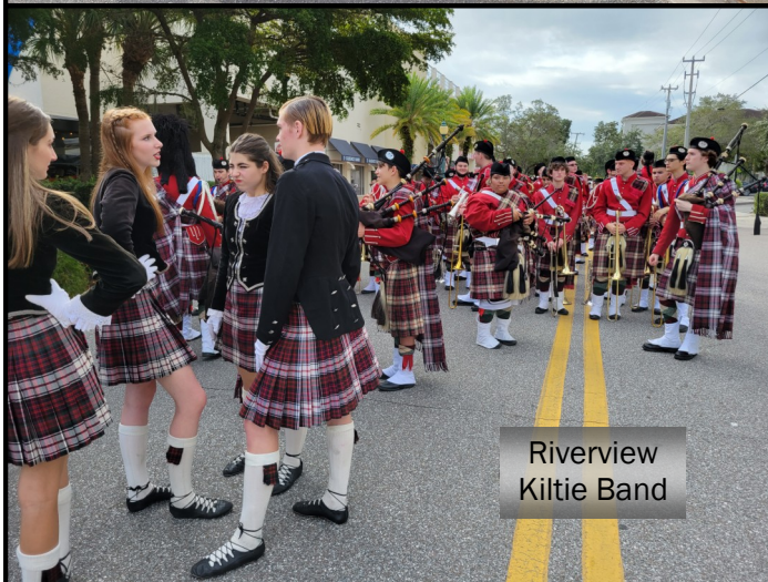
Riverview Kiltie Band