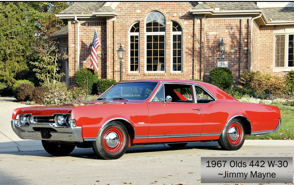
1967 Olds 442 W-30 ~Jimmy Mayne

2912 Bee Ridge Rd. Sarasota, FL 34239 SarasotaWowHomes.com