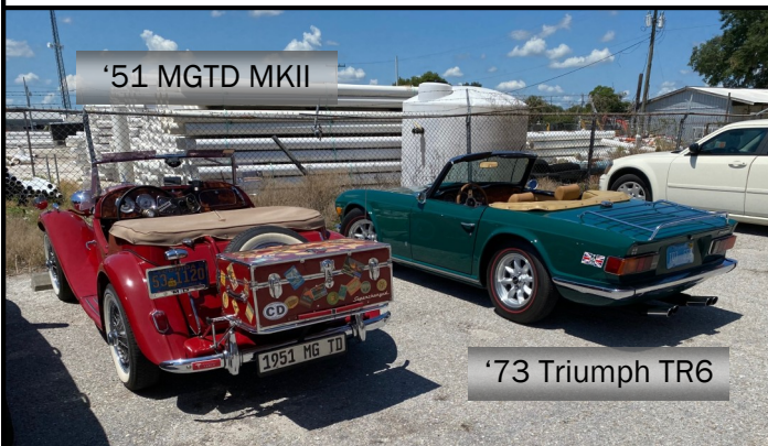
'51 MGTD MKII