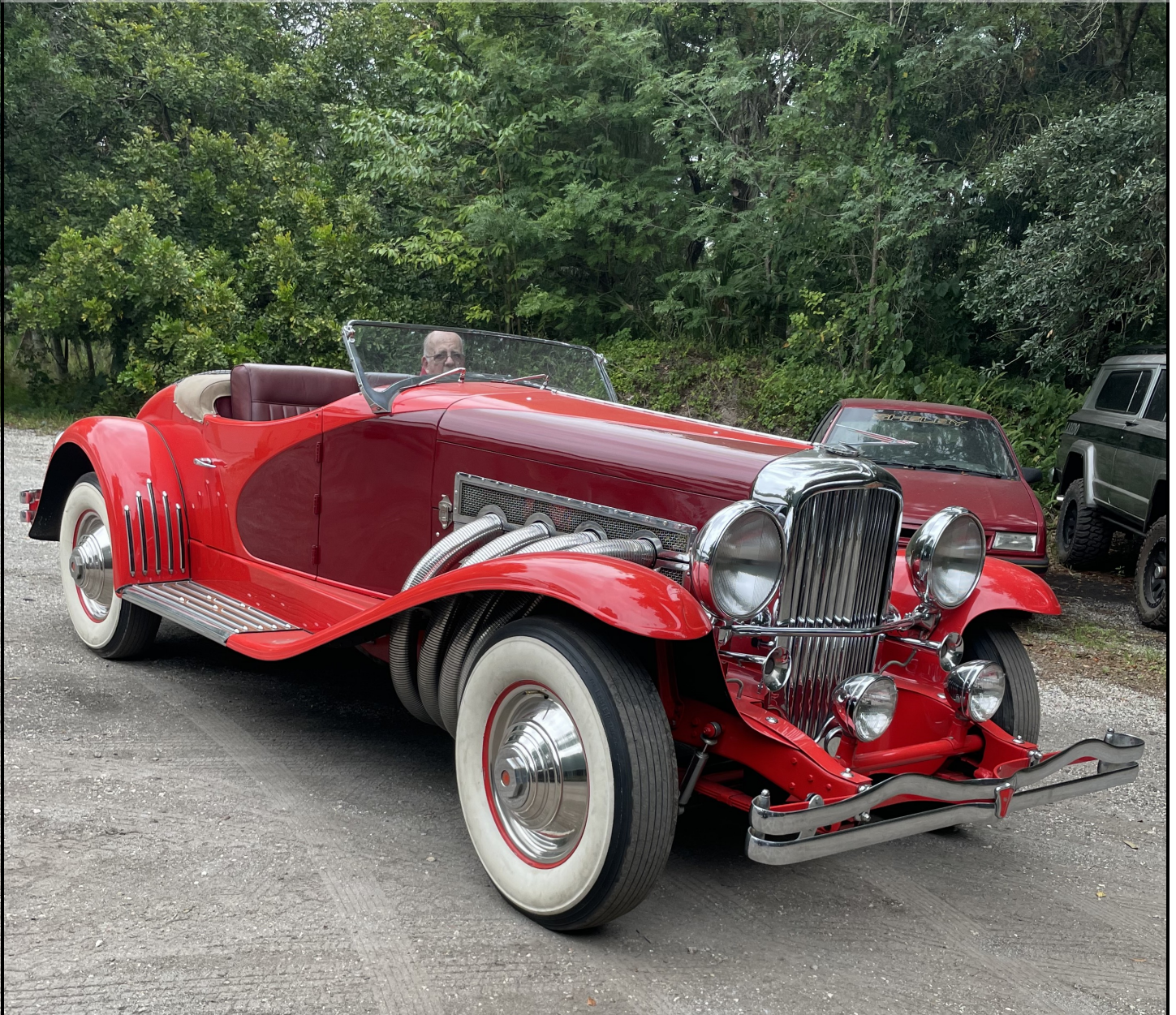
1972 Duesenberg ~ Gene Cohen ~ (See Page 2)