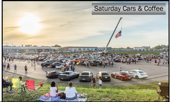
Saturday Cars & Coffee

Note: M1 is the designation for Michigan highway number 1 (which is also Woodward Avenue) and runs from downtown Detroit to Pontiac, MI.