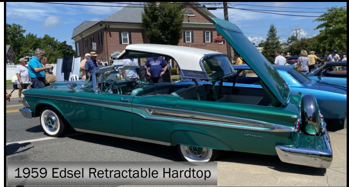
1959 Edsel Retractable Hardtop

I'd like to share photos with the club from a car event I attended on 7 August. One of the villages located on the south shore of Long Island is Sayville, NY, a maritime village with an active Chamber of Commerce which conducts an event referred to as "Summerfest". It's held the first weekend of August every year, other than two recent COVID related cancellations. It's a two day event, and it takes over the downtown village. The event includes a carnival at one end of town, including food trucks, and a series of numerous independent vendor tents which line up on two blocks selling many different types of items, from clothes to locally brewed liquor. On the second day, in addition to the aforementioned activities, they shut down Main Street to make room for every size & shape of collector cars.