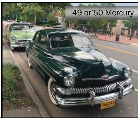
'49 or '50 Mercury