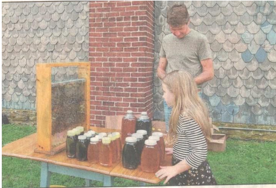
Daughter of Chavon Procyk