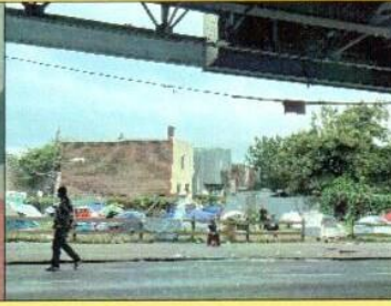
Tent encampment under the El