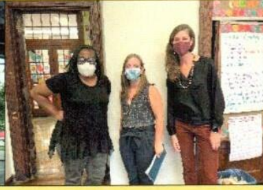
Meade principal and reading specialist