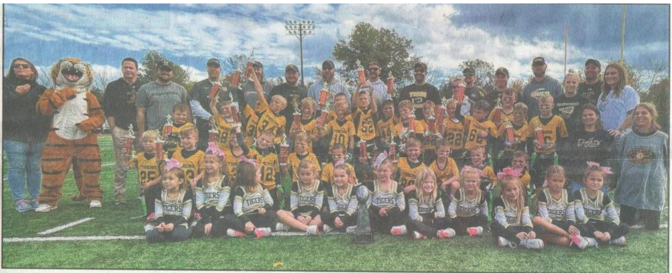
The Northwestern Youth Athletic Association competitive flag team beat Southern Lehigh 13-6 for this year's Colonial League Youth Football title.