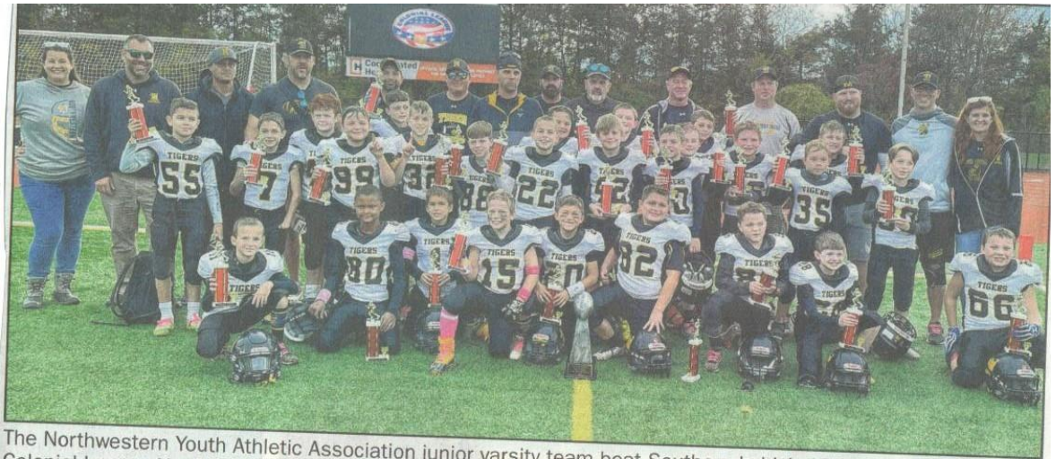
The Northwestern Youth Athletic Association junior varsity team beat Southern Lehigh 13-6 for this year's Colonial League Youth Football title.