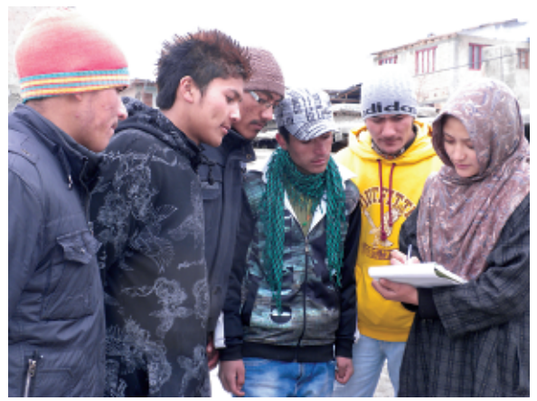
Peace Gong Reporter interviewing the youth in Kargil

It is commendable to see how wisely, the culturally aware citizens in the region have found new and interesting ways to create an engaging space where people can share their experiences, keeping culture, tradition and nature as the background. One such trend, seen during the festive seasons, is where people from remote locations come to participate in the ethnic programmes organised in the town and perform diverse rituals. One gets to see an amalgamation of various local cultures of Ladakh which also depicts the unity in diversity. This undoubtedly fascinates as well as helps develop a sense of responsibility among the community members to preserve this diversity.