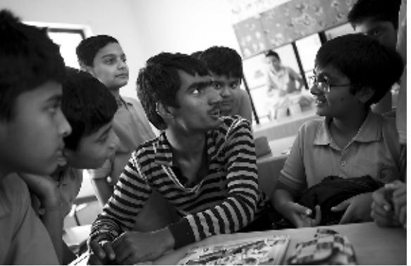
Special children at the Arushi Centre in Bhopal

We are living in 21<sup>st</sup> century and there are many disability to overcome their limitations. Persons with