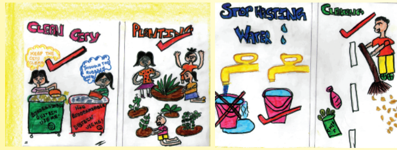
Illustration by Arijita Bose, New Delhi

On International Women's Day in 2007, I had been invited as a guest to the jail. The then