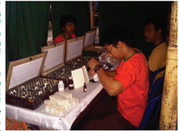
Volunteers disbursing medicine during the health camp

We recently organized a mass health camp in Gunungpring village located in the north-western side of Yogyakarta. Located in the valley near mount Merapi , this village and surrounding villages have been facing lot of difficulties owing to lack of