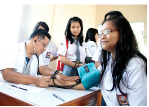
Blood Donation camp, Indonesia

The Red Cross youth organization has been encouraging school and college students to work as volunteers and help in