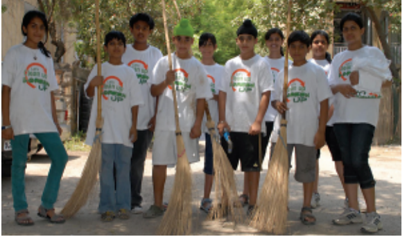
Students involved with the Clean Green Vision ready for a sanitation

he stinking sewerage, discarded plastics and rotten vegetable peels have always been a health hazard. The obnoxious