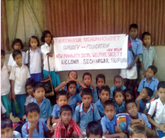
Members of Rabi Thakur Shishu Panchayat, Tripura