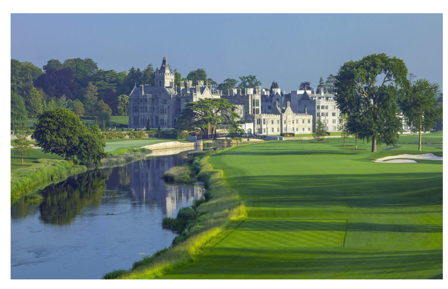
THE GOLF COURSE AT ADARE MANOR

The Golf Course at Adare Manor is unmatched in world golf. Set against Ireland's finest resort destination; there are few places in the world that offer a golf experience of this nature.