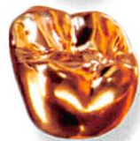
Full-Cast Gold Crown