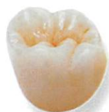
BruxZir Solid Zirconia Crown

These new high-strength Zirconia restorations are an excellent alternative to the traditional Metal and Porcelain.