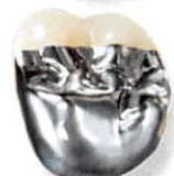
Porcelain and Metal Crown