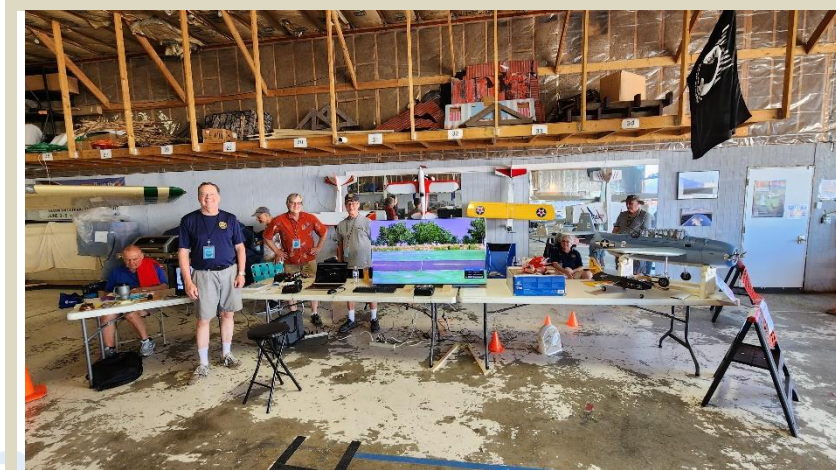
Prop Masters at Cavalcade of Planes.