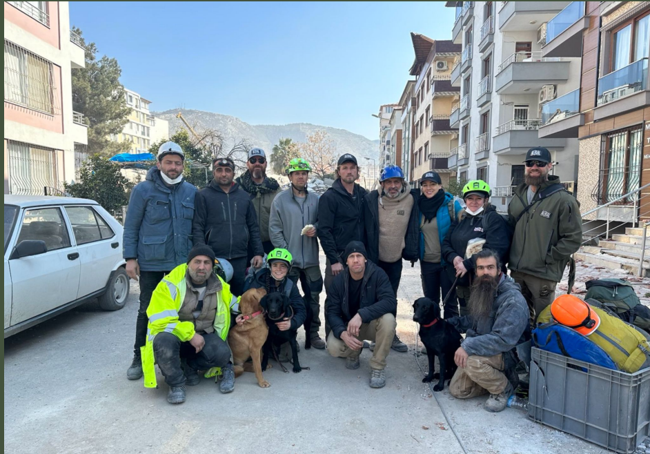
The Aerial Recovery Team responded to the devastating earthquakes in Turkey in 2023