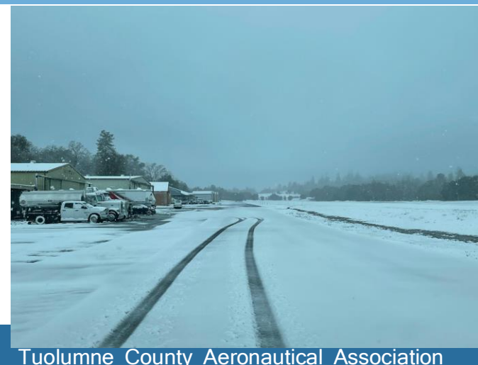
Tuolumne County Aeronautical Association