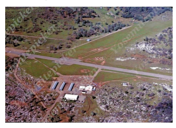
A Bellanca at O22 in 2014