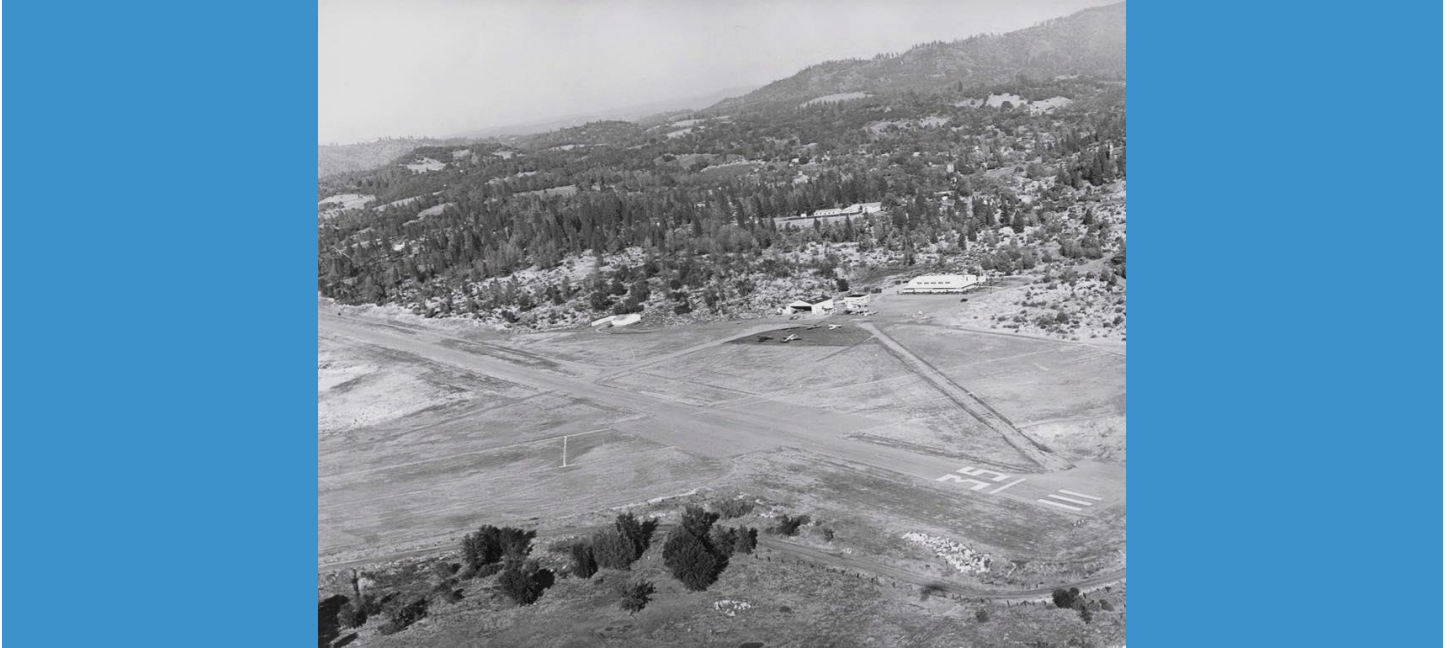
Undated photo Columbia Airport

TO BE THE CHAMPION OF AVIATION IN TUOLUMNE COUNTY