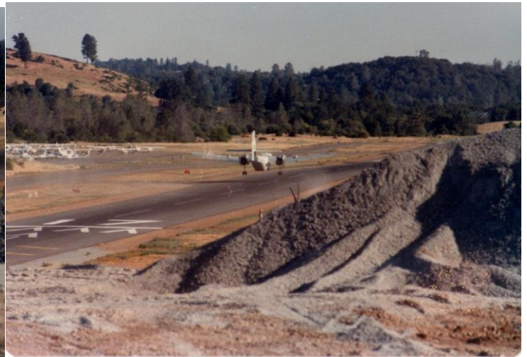
Photo of Army DHC-4 Caribou taking off from Columbia, Runway 17, dated pre-1998.