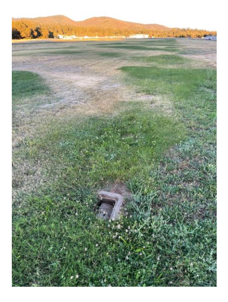
Open irrigation hole on runway 29. No action has been taken to repair the hazard since June.