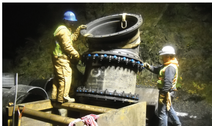
MWRA Northern Intermediate High Stoneham-Reading Connection (2011)