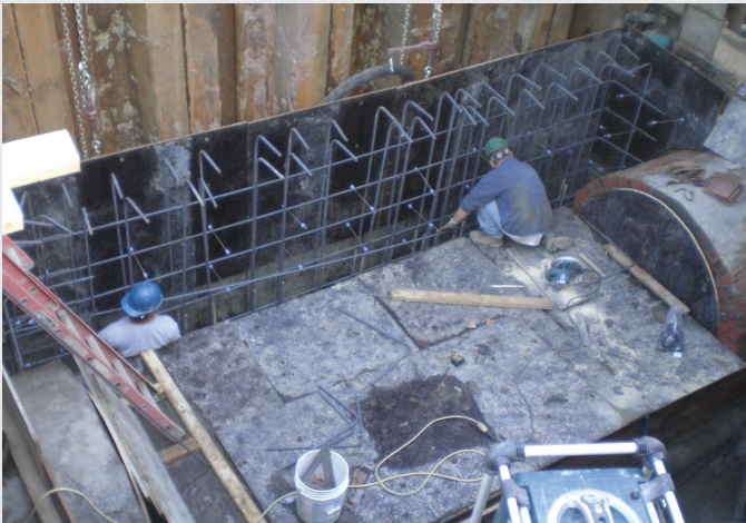
1. Casting concrete walls around the active 60-by-84-inch existing brick interceptor