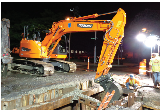
One major project currently being worked on by AD&S is BWSC Contract 11-309-009 Dudley Square Sewer Separation Project