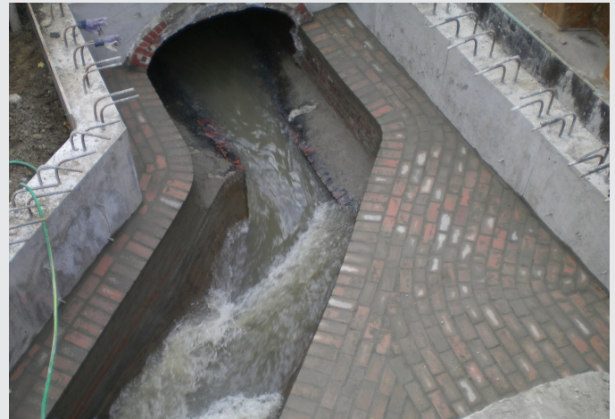
3. Invert built and flow redirected to the new 54-inch RCP