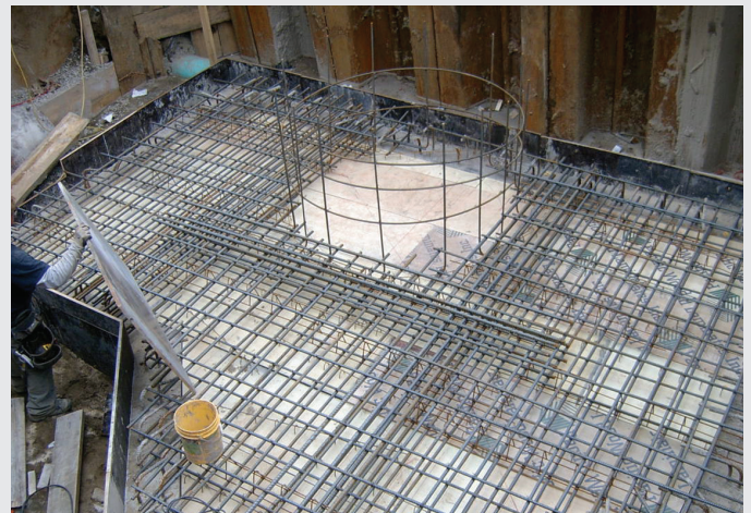
4. Casting the top slab of the new diversion chamber