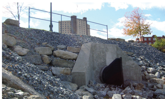
Lowell Regional Wastewater Utility – Cabot Street Area Sewer Separation Contract 10-01 Headwall at the Merrimack River – UMASS Campus (2010)