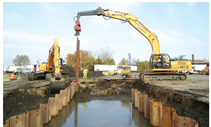
Everett Emergency Culvert Repair at Boston New Market Terminal (2012)