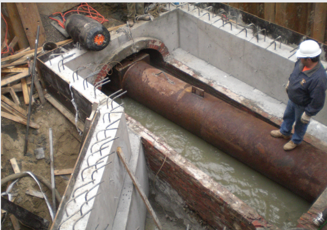
2. AD&S installing a flow through apparatus