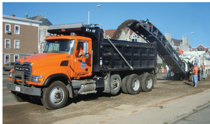
Lowell Regional Wastewater Utility – Cabot Street Area Sewer Separation Contract 10-01 Father Morissette Boulevard (2010)

UCANE is proud to count Albanese D&S, Inc. as a valued member of our Association since 1992. Our Officers, Board, and Staff want to wish them continued growth and success in the future. ■