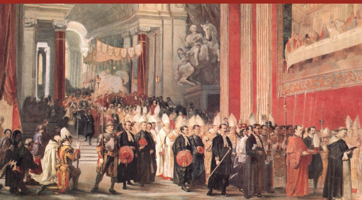
Corpus Christi Procession, 1824