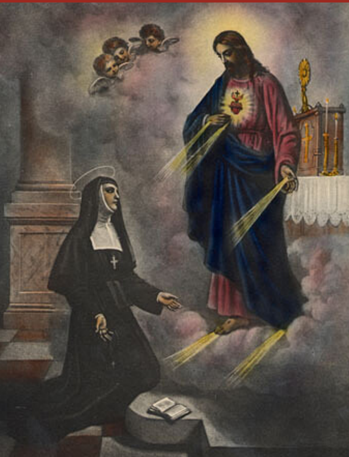
St. Margaret Mary Alacoque, 1647-1690