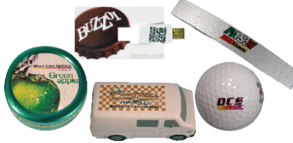
Ad Specialty Items